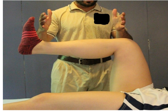
Figure 3. Gastrocnemius Reset. 23 Patient maintains hip and knee flexion and ankle dorsiflexion while the TC applies stimulation to the patella tendon and ankle dorsiflexors (tibialis anterior, and extensor digitorum longus).