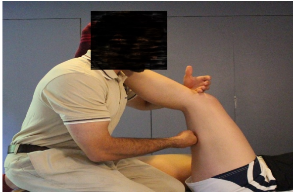
Figure 2. Hamstring down-regulate (dR). 22-23 Patient rests foot on the TC's shoulder while stimulation is applied to the patella tendon and each hamstring (semitendinosus, semimembranosus, and biceps femoris) muscle bellies.