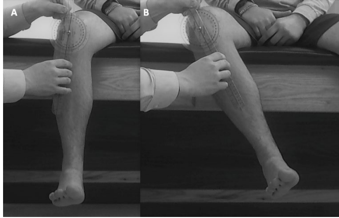
Figure 3. Active Hip External Rotation ROM Measurement with Goniometer

tibia. 2 Another possible theory is that the total arc of rotation at the hip, meaning the total degrees of hip internal and external rotation combined, could influence tibial loading, though there is limited empirical evidence to make a concrete connection here. 2 Even so, more research should be conducted to identify the relationship between hip external rotation ROM and ankle plantarflexion ROM on the development of MTSS.